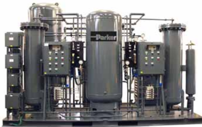
Model MB-600 Gas Seal unit