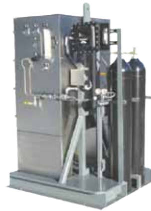
FB Cabinet model with back-up N2 cylinders