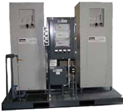
100% Redundant membrane package with auto switch-over for hazardous environments