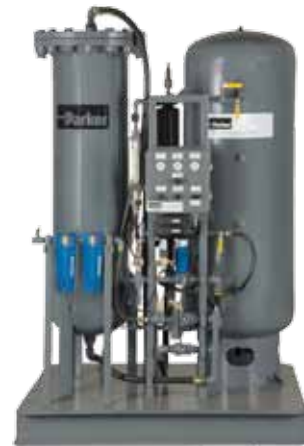
Parker Mono-bed PSA N2 generator